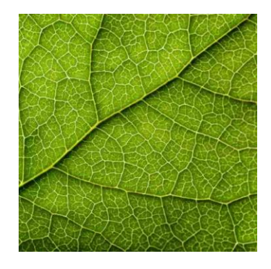
Our combined knowledge and experience allows us to provide advice, support and publicity to any public authority that wants to implement sustainable and innovation procurement.