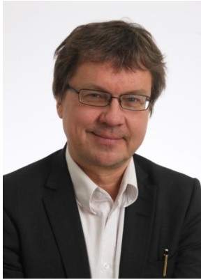
Procura+ Chair Pekka Sauri , Deputy Mayor, City of Helsinki