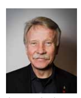
Ilmar Reepalu, Chairman of the Executive Board and Mayor of Malmö, Sweden

Sustainable development has been a central element in the regeneration process in Malmö. An important element to create a more sustainable city is our use of public resources. A wise use of our public resources can contribute to innovation of new products and services, business development and sustainable employment. Public procurement has driven the development of the clean fuel vehicle market in Sweden. It has a major impact on supplies of organic and sustainable food in the catering industry and not least fairly traded products. Malmö was the first of many Fairtrade cities in Scandinavia, where public procurement and co-operation with the private sector and voluntary organisations has brought dramatic change. Our challenge is to make sure that every euro we spend can maximise social benefits, reduce environmental impact and contribute to sustainable economic development. EcoProcura is an important event, during which we can learn from each other and explore ways in which Europe's cities can break new ground to create a more sustainable economy.